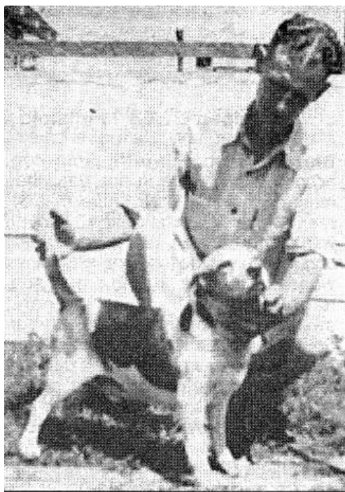
Elmer Gray with FC Gray's Linesman in 1947 (From The Linesman Story by Elmer Gray) Whelped 5/28/36 - Died 7/19/50