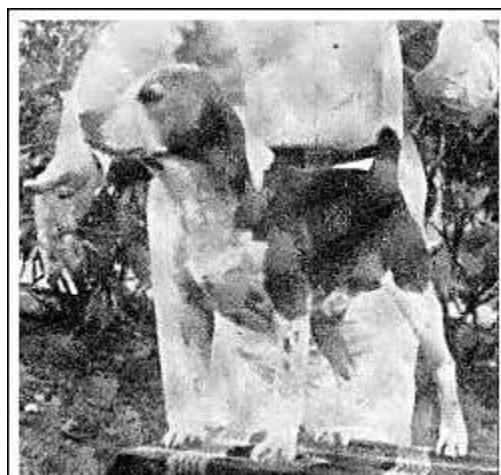
Fish Creek Farmer