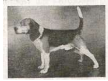
Fd. Ch. Pleasant Run Lawyer