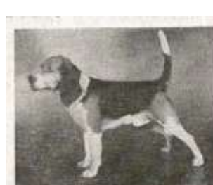
FC Pleasant Run Lawyer

Here again, we have an illustrious pedigree that is full of old time hounds.