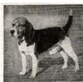
FC Pleasant Run Leader