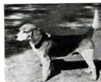
FC Contentnea Jack II