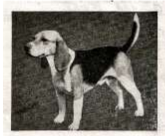
FC Pleasant Run Banker