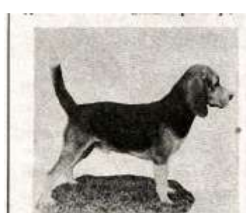
Fd. Ch. Nu-Ra Buddy