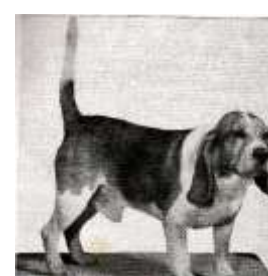
Fd. Ch. Car-E-Line Buddy