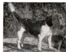
Fd. Ch. Jimmy's Little Sportsman

Now let me take you a generation further back by telling you what some of the hounds in the last generation trace to. First, Fd. Ch. Sambilly Joe was pure Blue Cap; Bardstown Fidget's sire was Fd. Ch. Gray's Linesman; then Fd. Ch. Pleasant Run Banker was also a son of Fd. Ch. Gray's Linesman; Arcadian Ann was sired by Fd. Ch. Flip of Shady Lake; Bun-field Spot II was sired by Fd. Ch. Button's Tuffy, a son of Yellow Creek Sport; Fd. Ch. Pleasant Run Leader was a brother of Pleasant Run Banker and also a son of Linesman; Fd. Ch. Noble County Sammy was sired by Fd. Ch. Sammy R; Fd. Ch. Stinard's Sandy Sam was a son of Fd. Ch. Gray's Captain and grandson of Linesman; finally Marshville Daisy was a son of Fd. Ch. Pine Hollow Nifty and a grandson of Fd. Ch. Sammy R. Pretty illustrious line-up, wouldn't you say? Indeed it was. One well-known bitch that resulted from this mating was a female named Gay Fury . Fury was best known for the hounds she produced, but that is getting ahead of my story, let's see what her pedigree looked like: