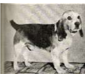
Fd. Ch. Kanauga's Shiek