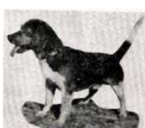
FC Lone Hickory Ranger