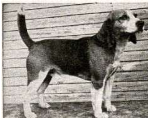
Am CH Bunny Run Ivan