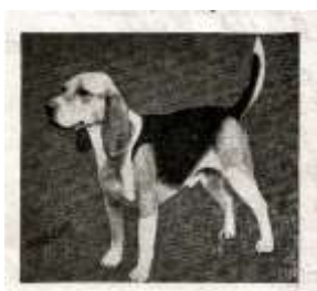
FC Pleasant Run Banker