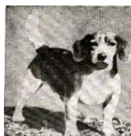
FC Rippling Run Ringer