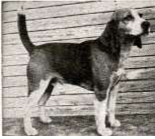
Fd. Ch. Bunny Run Ivan