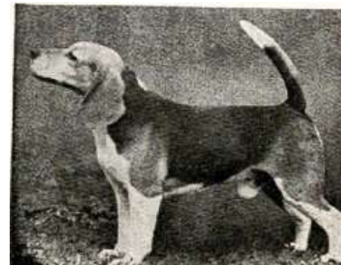
Am CH C S Robin