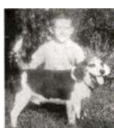
FC High Rock Ranger

Fd Ch Williarn's Pointline Buddy {Sire of: GAY BAKER} Here is a run down on what of the last generation trace to. First, Banker to Gray's Linesman; Dearman's Jeny to Fd. Ch. Sammy R; Rippling Run Ringer to Fd. Ch. Blackfork Honey Boy and ' Creek Sport; Rocky Knob Sally to Fd. Ch. Conte Jack II; Parker's Jack to Banker again; and Wilson's Betsie to Fd. Ch. Bishop's Meddler; Fd. Ch. Nol Buddy to Gray's Captain and Bishop's Bugler; Pa Carolina Sue to Pine Hollow Nifty (on her dam's Nu-Ra Buddy to Banker, etc.; Fd. Ch. Lynch's Mek Babe to Fd. Ch. Step Ahead Rusty and Fd. Ch. Gray's Linesman; Fd. Ch. Dickburn Lad, Jr. to the Blue caps and Sammy R; Banker's Lady to Banker and Fc Amawalk Si; Fd. Ch. Bishop's Emperor we mentioned previously; Rogers Pemrose to Fd. Ch. Lan-Chester'Chief Leader and other descendants of Linesman; Kilby John to Fd. Ch. Dickburn Lad, Jr. again; and Wi Cutie to Fd. Ch. Lan-Chester's Chief Leader again.